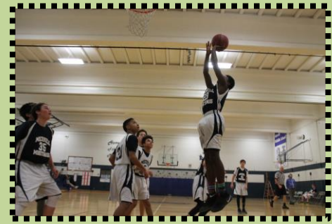
Basketball, continued from page 3

For more information: @unexplainedposts, http://metro.co.uk/2014/08/05/marilyn-monroe-death-conspiracy-theories-who-or-what-killed-marilyn-4817019/ , http://www.snopes.com/history/american/lincoln-kennedy.asp